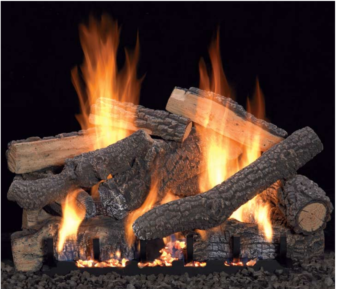
Refractory Ponderosa Log Set (LS-24P) with Vented Slope Glaze Burner System (VSR-24) rated at 75,000 Btu

Our Vented Burners, available in the Slope Glaze Series only, are rated at up to 75,000 Btu to create taller flames. All vented log sets are rated as decorative systems (not for use as heaters), and must be installed in a vented fireplace with the damper open. Vented Slope Glaze burners are available in 18, 24, and 30 inches in Millivolt and manual models. The Millivolt Vented Burners may be operated with an on/off remote control or wall switch. Because they are not heating systems, Vented Burners may not be operated by thermostat.