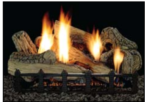
24-Inch Canyon Log Set (LS-24RS) on Vent Free Harmony Burner with Decorative Cast Grates (DCG-24-BL).