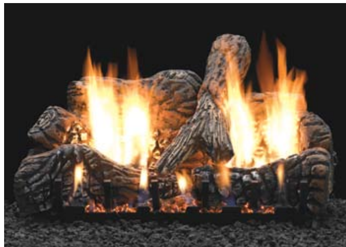
Ceramic Fiber Charred Oak Log Set (LS-24C2) with Slope Glaze Burner System (VFSR-24)

Even our manually controlled log sets offer three heat levels, so you can keep the cold winds at bay without overheating the room.