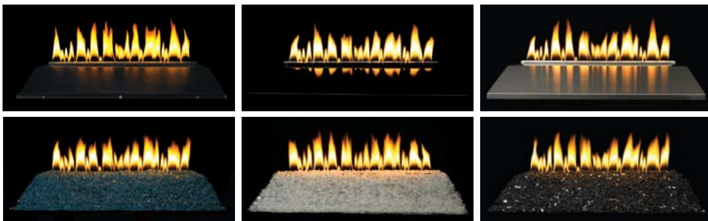
Top Row left to right: No Decorative Options, Polished Black Decorative Top, Brushed Stainless Steel Decorative Top. Bottom Row left to right: Blue Clear Decorative Glass, Clear Frost Decorative Glass, Polished Black Decorative Glass