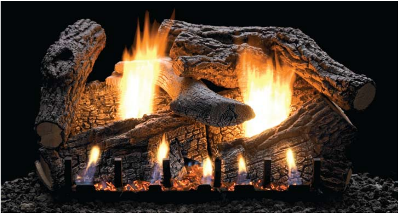
Refractory Super Sassafras Log Set (LS-24RSS) with Slope Glaze Burner System (VFSR-24)