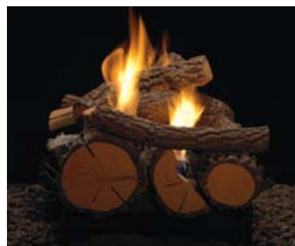
Opposite Side View (above) and End View (below)