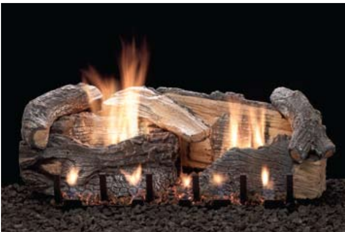
Refractory Aged Oak Log Set (LS-24RAO) with Slope Glaze Burner System (VFSR-24)