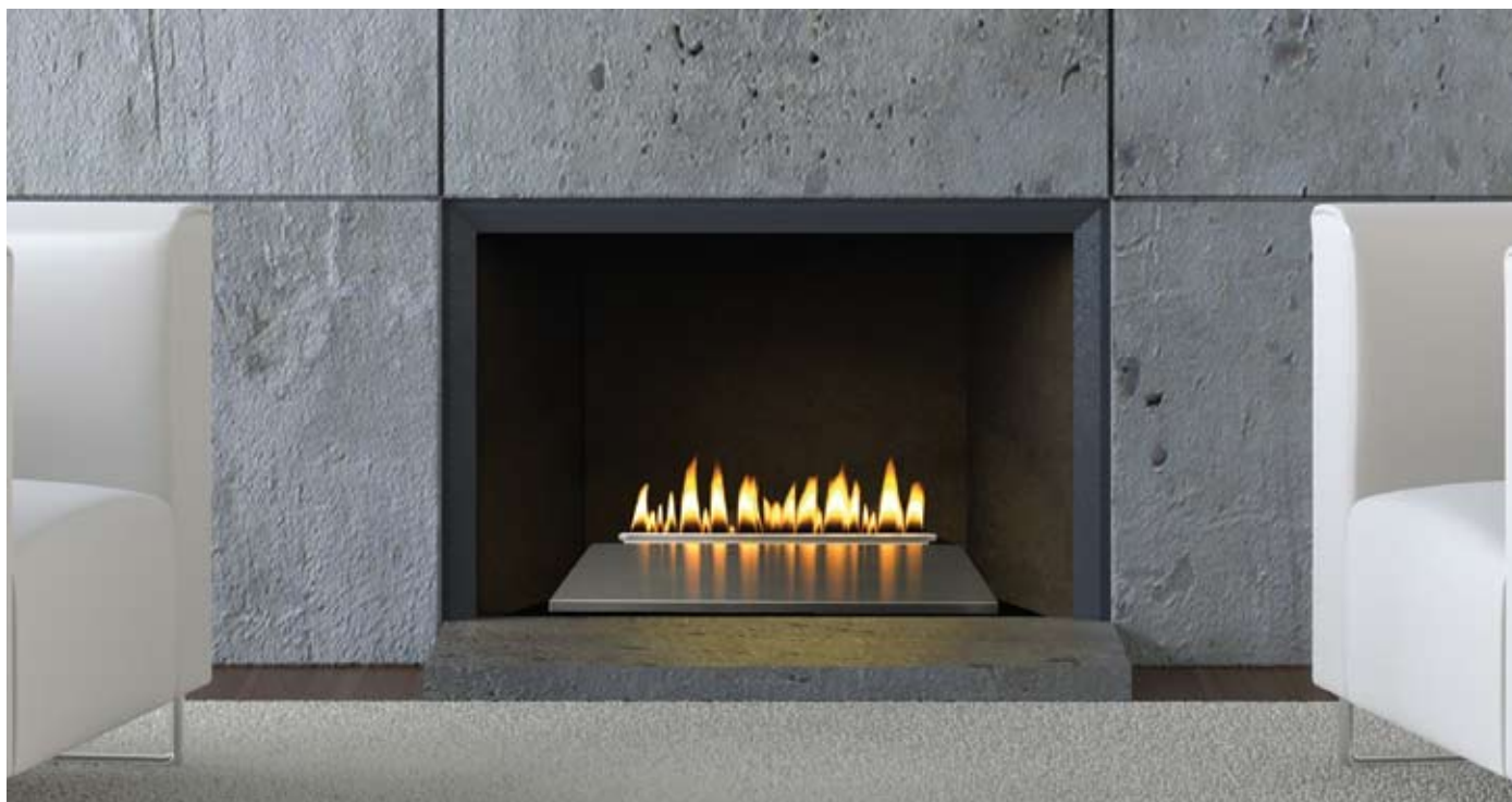
Loft Series Burner (VFRL-24) with Stainless Steel Decorative Top (DT-24-SS). Shown in existing masonry firebox.