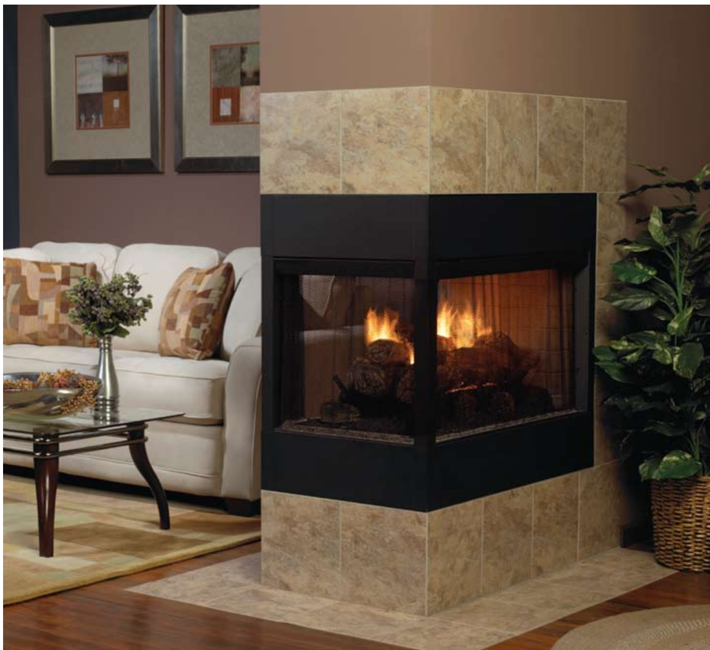
White Mountain Hearth Stone River Log Set (LSU-24SF) on a Vent-Free Slope Glaze Vista Burner. Shown in a peninsula firebox with custom tile surround. The optional Large Log Embers Kit (EK-2) and Platinum Glowing Embers (PE20) add that extra spark of realism.