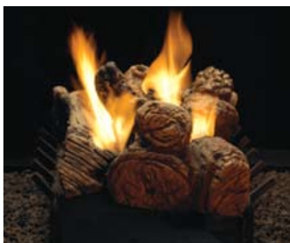
Opposite Side View (above) and End View (below)