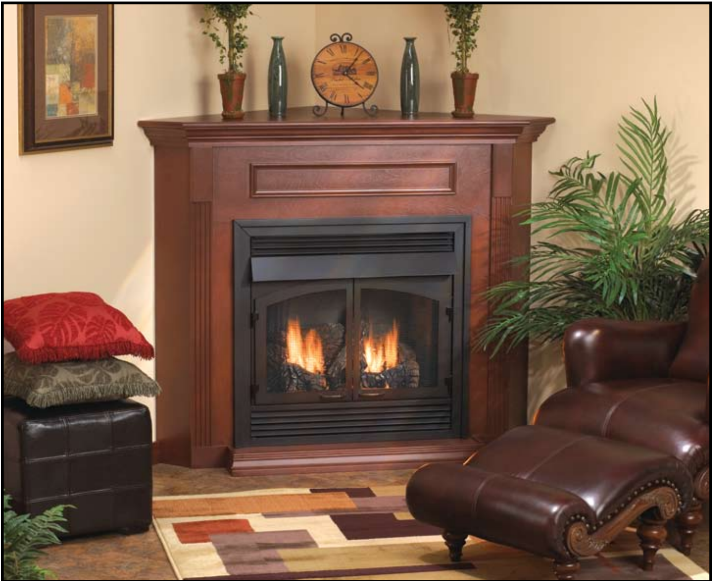
White Mountain Hearth Charred Oak Log Set (LS-24C2) on a Vent-Free Slope Glaze Burner with variable remote control system (VFSV-24). Shown with a 36-inch Breckenridge Deluxe Vent-Free Firebox with Brick Liner (VFD36FB) trimmed in black louvers, black hood, and shown with optional black frame, black door frame and black arch doors (DVF-36BL, VFY-36-SBL, and VFR-36-SCBL). The Cherry Finish on the Standard 36-inch Corner Cabinet Mantel (EMC-36-C) adds drama and warmth to any setting.

Empire manufactures log sets and burners to suit any application. With sizes ranging from 16 inches to 30 inches, and log pieces ranging from slender to massive, the White Mountain Hearth collection is sure to have the perfect set to fill your fireplace.