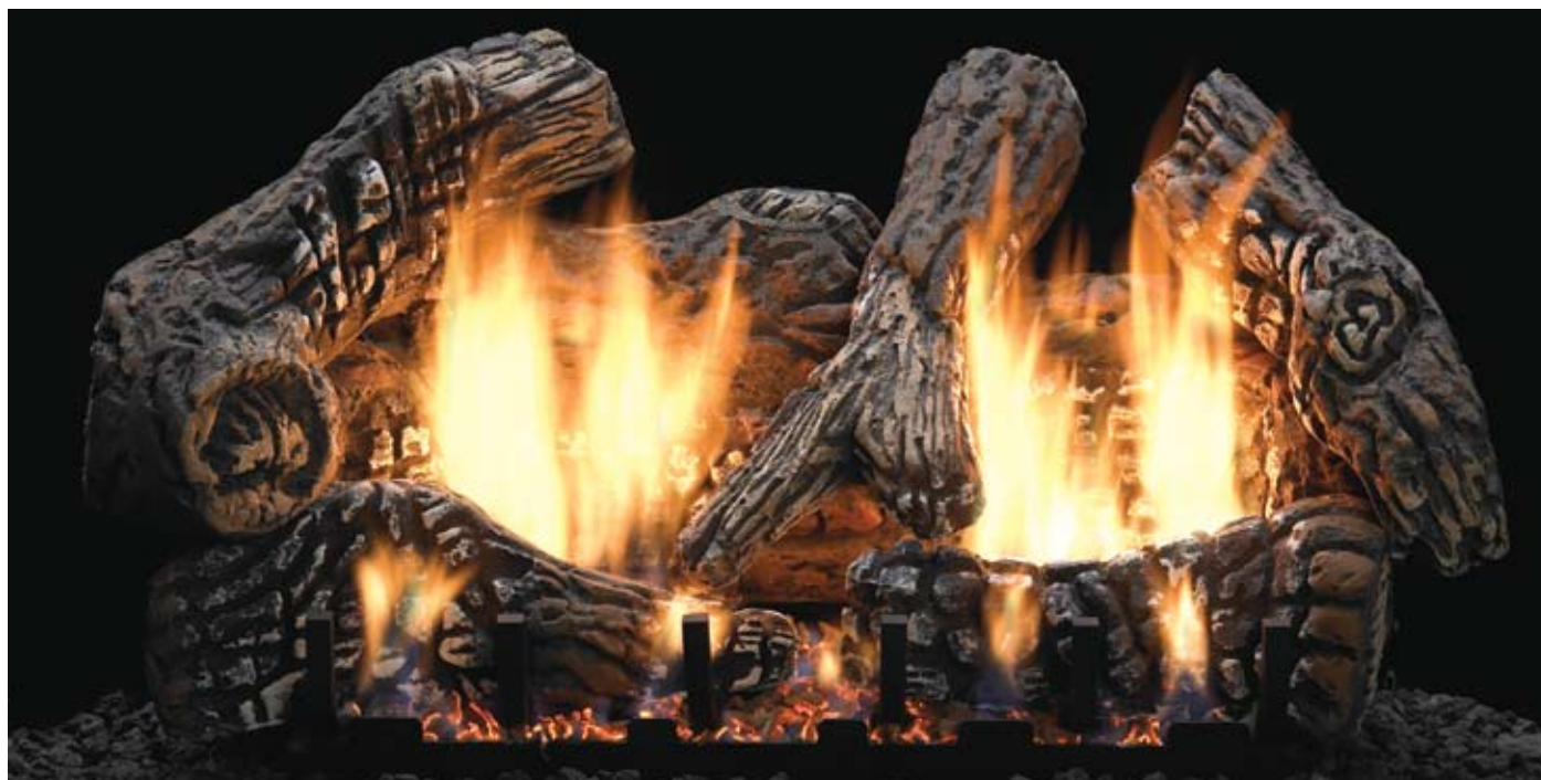
Ceramic Fiber Super Charred Oak Log Set (LS-24C2S Shown) with Slope Glaze Burner System (VFSR-24)