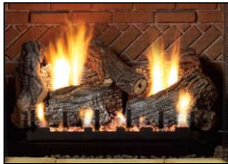
24-Inch Sassafras Log Set (LS-24RS) on Vent Free Slope Glaze Burner with LR-24 Log Riser in Vent Free Select Firebox.