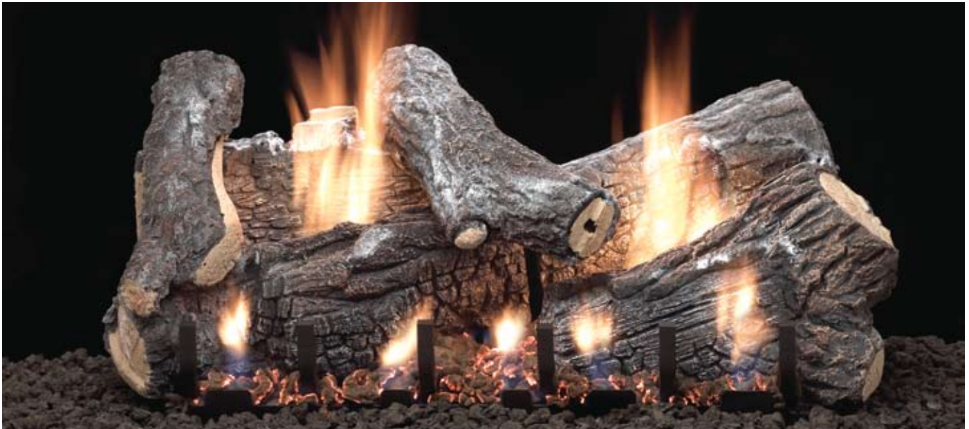
Refractory Sassafras Log Set (LS-24RS) with Slope Glaze Burner System (VFSR-24)