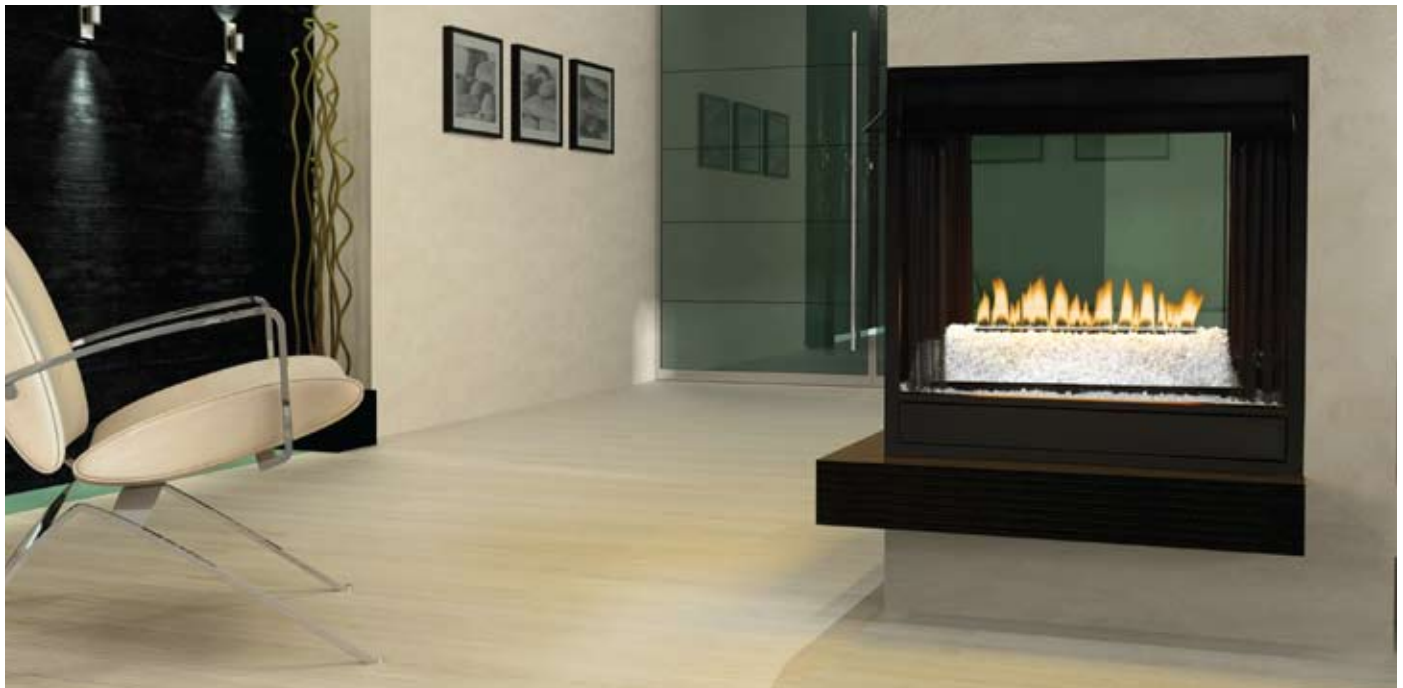
Loft Series Multi-sided burner (VFRU-24) with Clear Frost Decorative Glass (DG-30-CLF). Shown in a Vent-Free peninsula firebox with Flush Louvers.