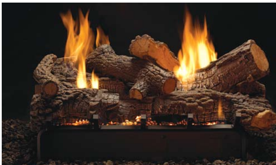
Rugged Refractory logs give the Rock Creek Log Set a rustic look on a grand scale.