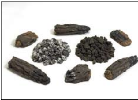
EK-1 Traditional Ember Bed Kit includes six burnt log pieces, white ash, and lava rock. EK-2 Large Ember Kit available for Multi-sided log sets.