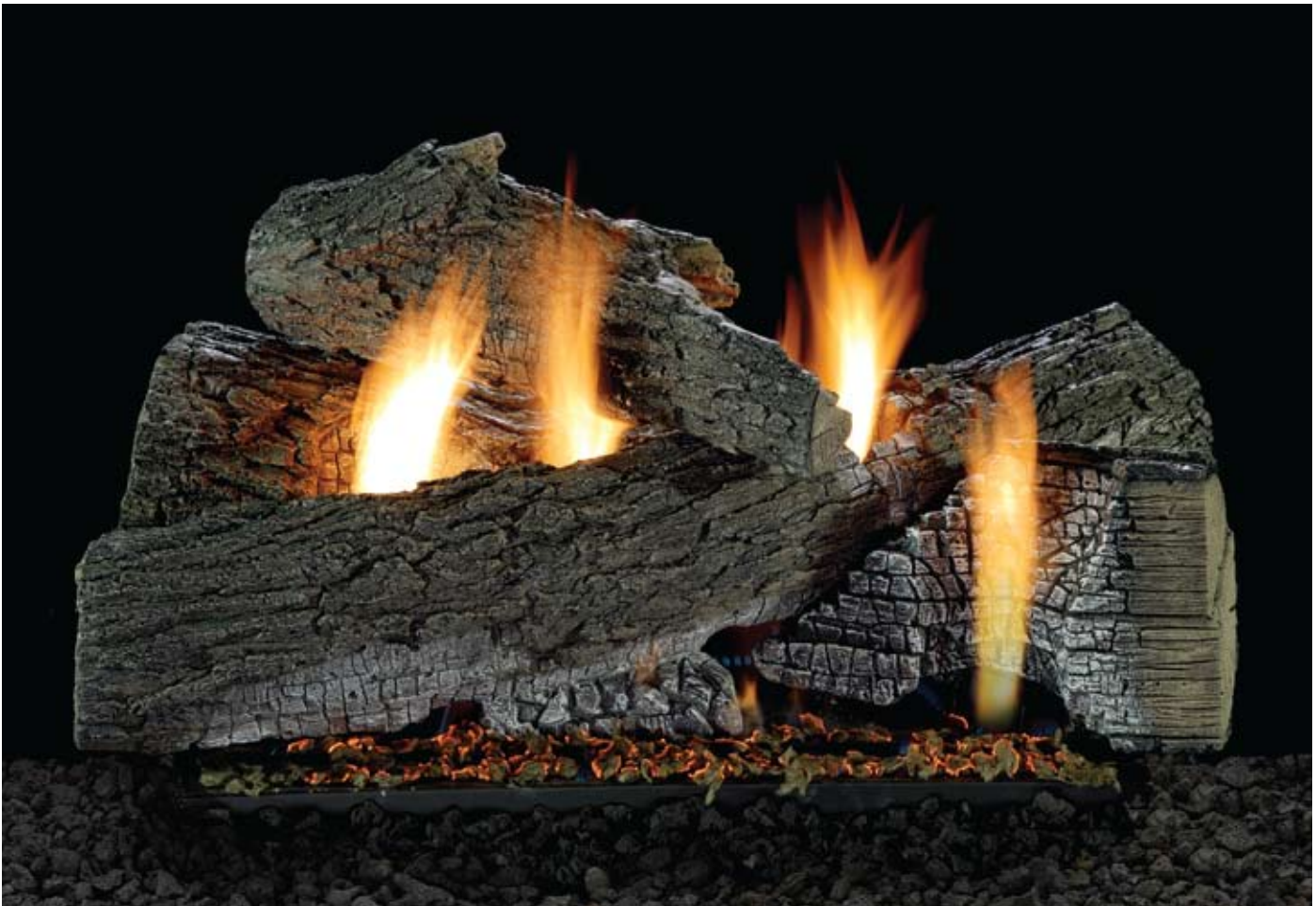
Refractory Wildwood Log Set (LX-24WR) on Harmony Burner with Expanded Ember Bed (VFXI-24)