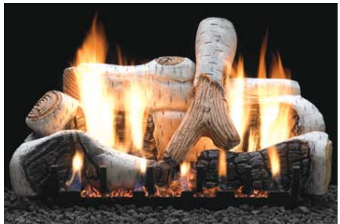
Ceramic Fiber Birch Log Set (LS-24B2) with Slope Glaze Burner System (VFSR-24)