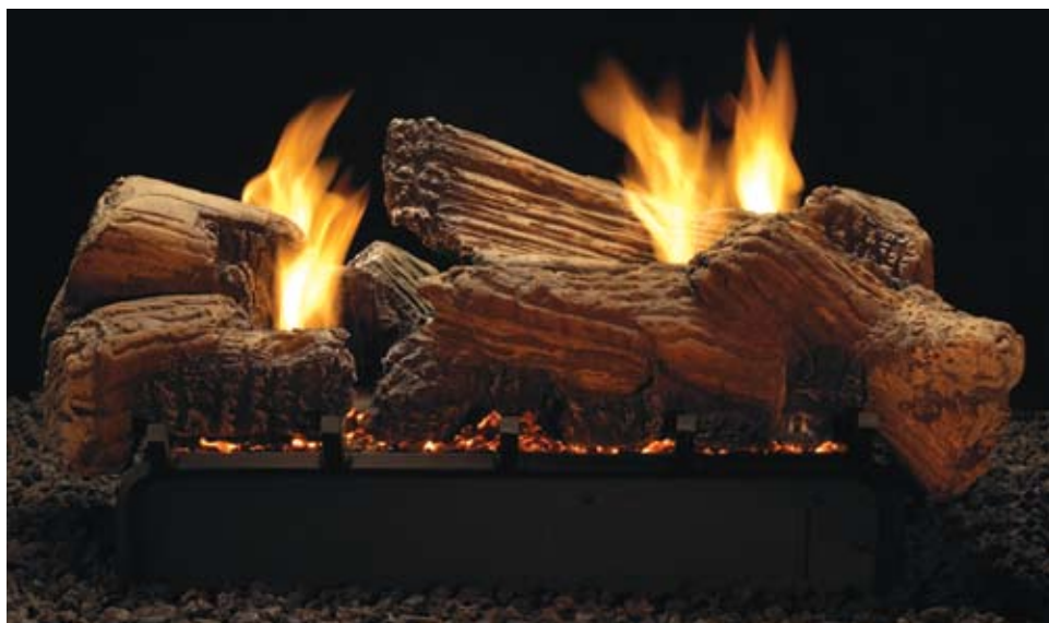
Just like a real wood fire, the Stone River Ceramic Fiber Log Set provides a different look from every angle. The Slope Glaze Vista Burner neatly conceals its controls behind a sliding panel.